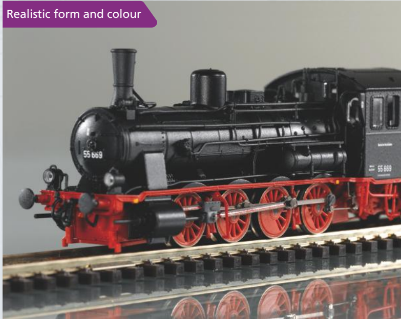
Realistic form and colour